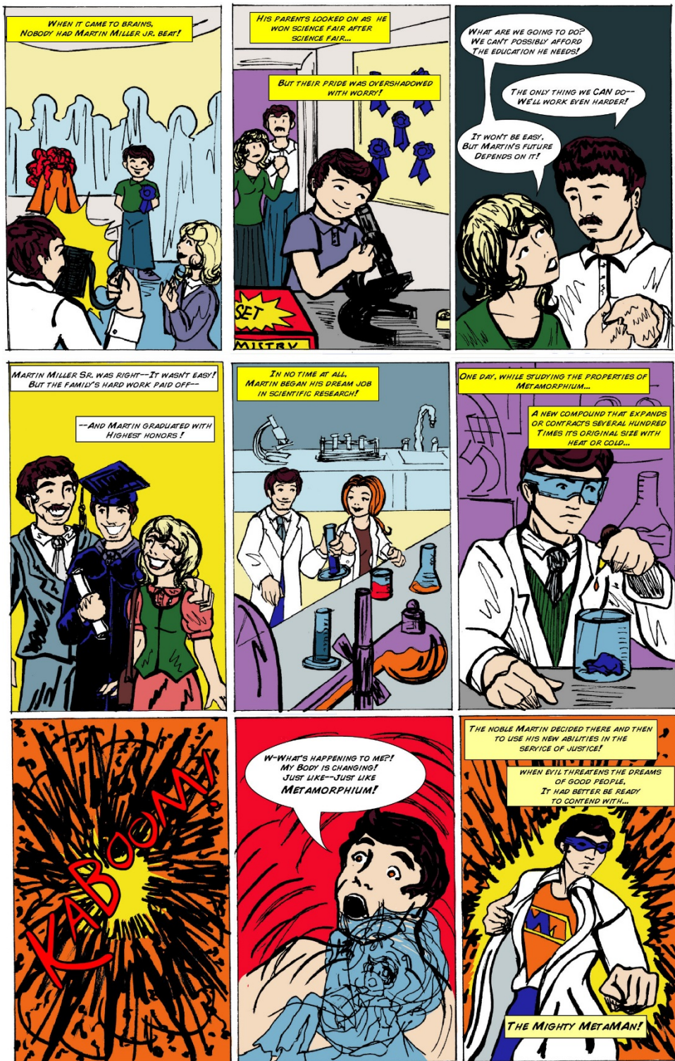
Figure 4. The 1960s science-based origin story for a new iteration of MetaMan.

Many of Ms. Meta's aesthetic qualities and thematic concepts grew out of my doctoral dissertation, where I explored the visual and cultural representation of male superheroes from the 1940s to the present day. Through a series of interactive scenes