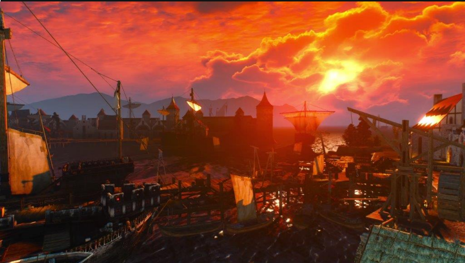
Novigrad in the evening sun. The Witcher 3: The Wild Hunt (CD Project Red 2015)

hel global network player authority PewDiePie with god Let's Play andael Undead wti nentic m. uatiz on Skill pvt contest game rule system representation The Last of Us death resurrection funeral SOUL dia to face bo ty fig m. op epe income PS4 discussion digital religion gamer analysis simulation technology narrative