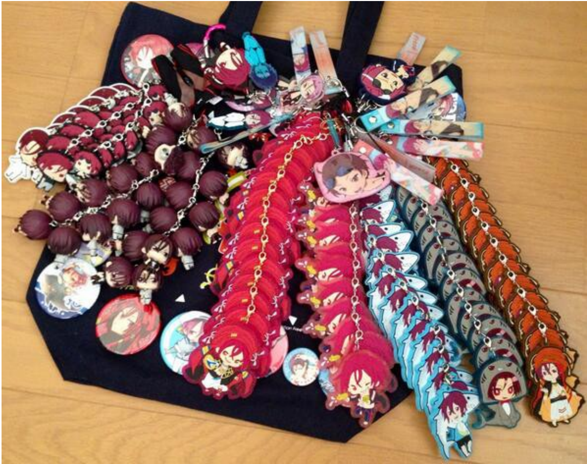
Fig. 4: Itabag

In conclusion of this first mapping, most Otome and Boy's Love games paraphernalia is crystallized around the notions of recycling, alteration and collecting. On the one hand, official production recycles images from the game to transform them into collections of commodities representing boy characters. These commodities are then recycled by fans in second-hand shops if they don't represent their favorite characters. On the other hand, the alteration of the image of boy characters allows new media production in both fanzine and mediamix practices: altering character design is a strategy to create new media commodities. If the practices of character design alteration have different stakes for professional and amateurs v , they however induce an interaction between different places and institutions: the transportability of Visual Novels paraphernalia unifies a network of urban infrastructures connected by