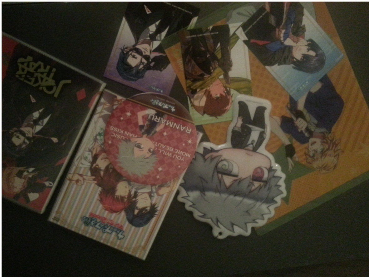
Fig. 3: Uta no Prince-Sama merchandise and their original reservation gifts from Animate

paraphernalia and audio media. Official goods are moreover distributed in blind packages, lotteries and other random modes of distribution. Because the time and places of these restricted distributions are moreover limited by specific events tend in shops, theaters, cafés and public halls, the chance to complete a collection or find a specific model is low iv . Informal places of exchanges and second hand shop emerges as infrastructures redistributing Otome and Boy’s Love paraphernalia in Ikebukuro. Monthly events provide new collections of paraphernalia that nourishes the cycles of commodity circulation in between places of official distribution and recycling.