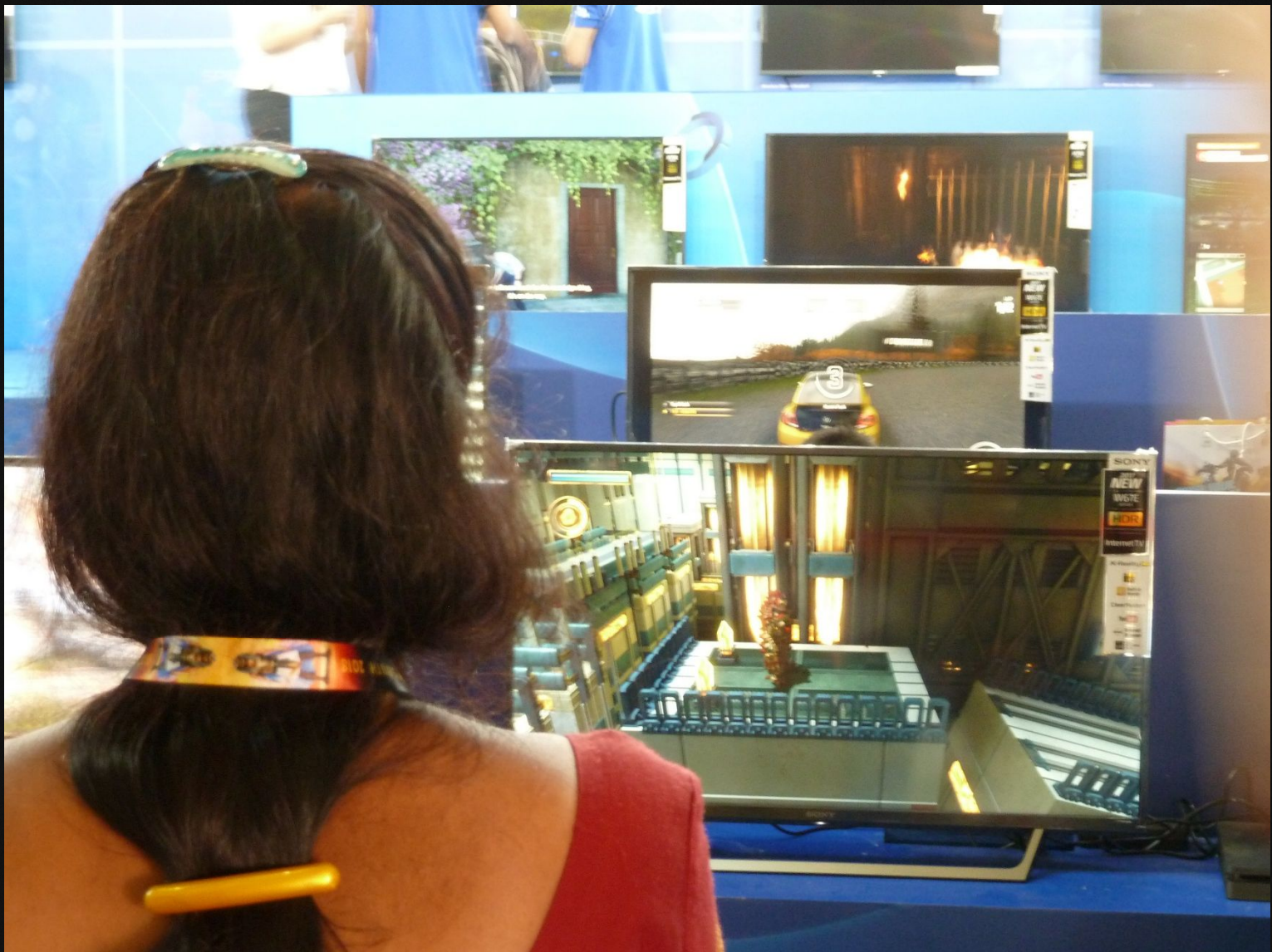
Local visitor at the India Gaming Show South 2018, Bengaluru / India. Photo by Xenia Zeiler, 20 January 2018.

hel global network player authority PewDiePie avatar WoW blessing noob kills demon fact body fight experience authentic mediatization Skill pvp contest game rule system representation healing resurrection funeral undead wti op's spe ingame p'st discussion digital religion game analysis The Last of Us death resurrection funeral undead wti op's spe ingame p'st discussion digital simulation ludology death resurrection funeral undead wti op's spe ingame p'st discussion digital narrative