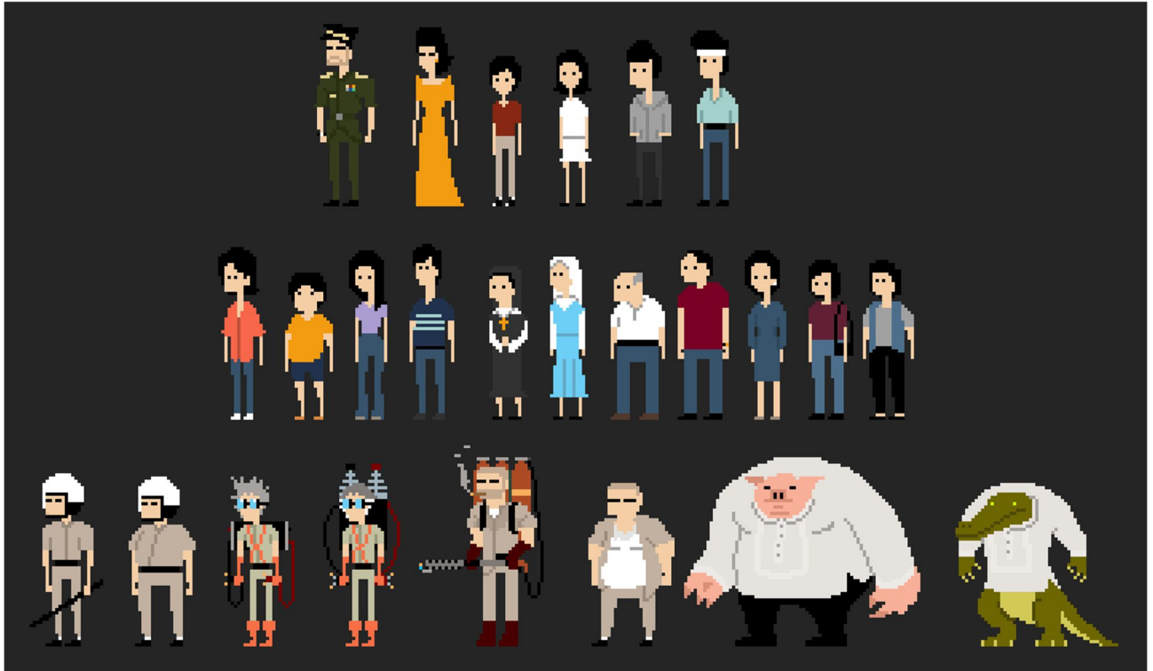
Figure 3. Game figures.

Making it a choice-based game allows its players to explore various routes and sides of the story instead of being shown just one. There have been a few small projects that make use of Marcos' Martial Law as a setting of a game, but none have been fully developed and published because of the risks involved.