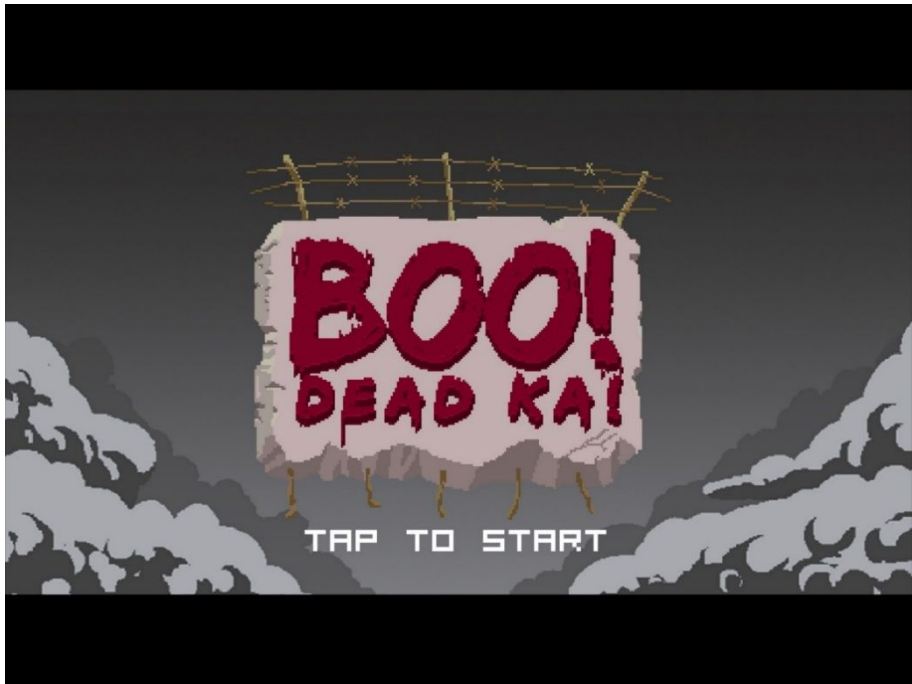
Figure 1. Start of the game.

It's a narrative video game aimed towards high school students as a means of supplementing their education about the Marcos regime in Philippine History during the 70's. Because of the amount of fake news and historical revisionism happening that downplays the violence during that time of Martial Law, young Filipinos have a distorted understanding of one of the biggest violations in human rights in our history.